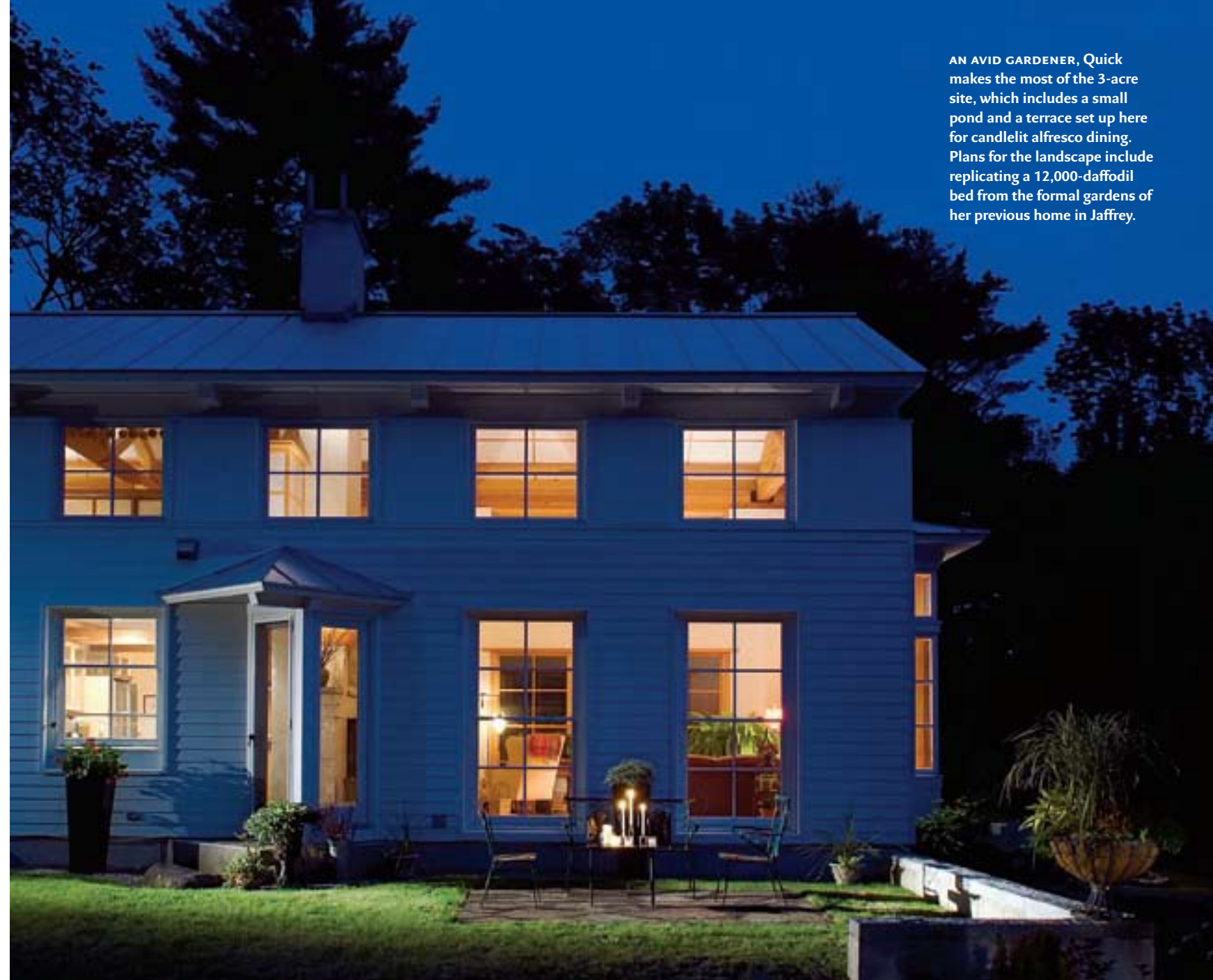
AN AVID GARDENER, Quick makes the most of the 3-acre site, which includes a small pond and a terrace set up here for candlelit alfresco dining. Plans for the landscape include replicating a 12,000-daffodil bed from the formal gardens of her previous home in Jaffrey.

But on summer days, the walls of windows flood the space with light. For a fluorescent effect in the great room, where she spends most of her time, Quick painted the ceiling pale cotton candy pink and faced the interior chimney in brown-toned crimson Indiana limestone stucco. Quick's