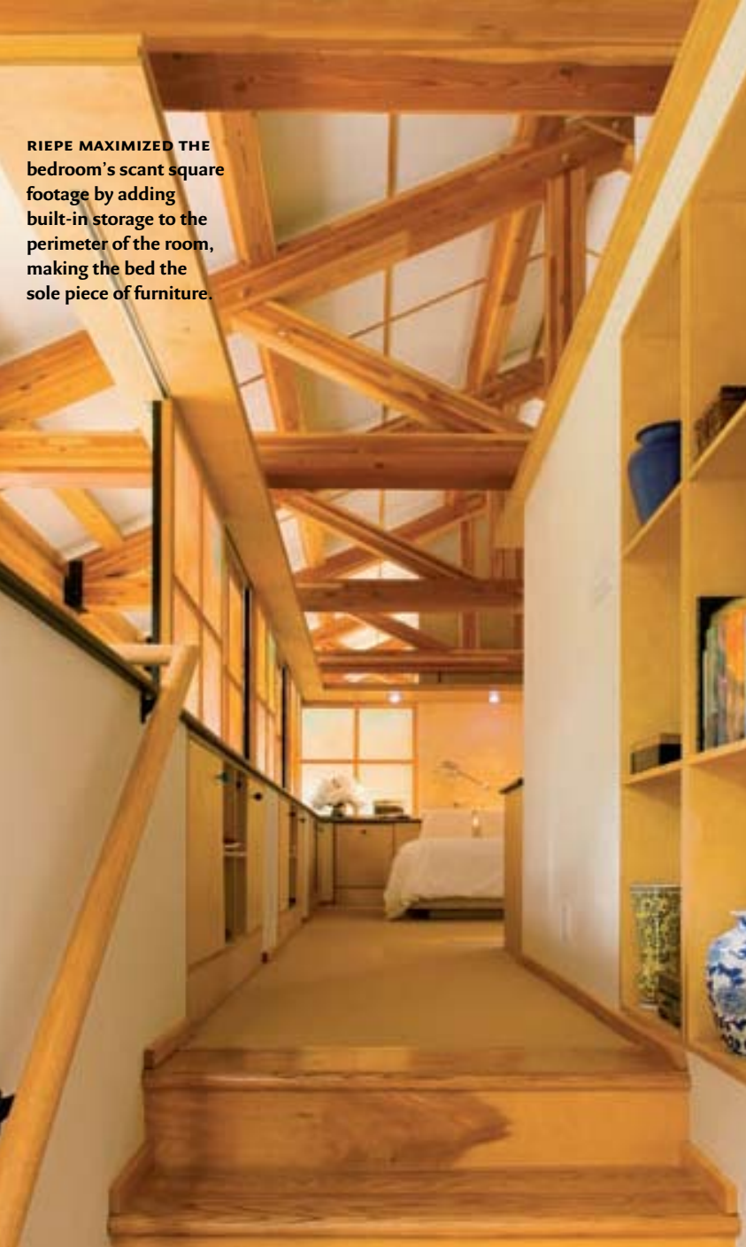
RIEPE MAXIMIZED THE bedroom's scant square footage by adding built-in storage to the perimeter of the room, making the bed the sole piece of furniture.